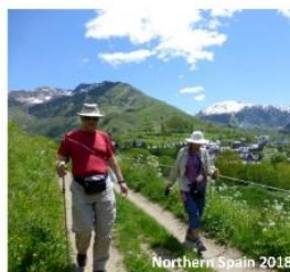
Northern Spain 2018