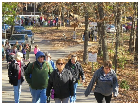
Gateway Milers World Bird Sanctuary Walk in St. Louis, MO on 11/12/16. This was also a designated Girl Scout "Walk Together" entitled Ramble with the Raptors.

We are still looking for 4 more clubs to volunteer for a pilot program working with your local grade school. This would require one or