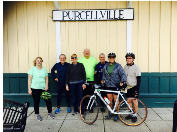
"Volsbikers celebrating Veteran's Day 2016 with a ride on the W&OD Trail between Leesburg and Purcellville, VA".