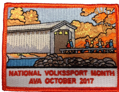
National Volkssport Month Patches still available.

Here is the official AVA participant information request form. Click here to open .