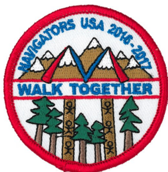
Navigator Patches still available

Now that AVA is having more Bike Events, you may want to encourage purchasing Bike Books. That will be the way we can monitor how well the program is doing. In the past several years there were only a few bike events, so it was decided that the distances could be put in the Blue, Orange, and Yellow books. With more events, and traveling Bike stamps, it is important that we keep track separately.