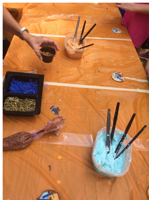
Southeastern Missouri Council scouts making Walk Together cookie patches!

Congratulations to Gateway Milers for hosting the very first AVA ACE-Y event, The Mastodon Ice Age Hike November 10, 2018. The Club advertised their event by attending the local Girl Scout Roundup with a cookie decorating activity, scouts decorated cookies to look like the Walk Together Patch while Gateway Miler members passed out flyers to leaders and adults. The Mastodon Ice Age hike attracted 156 pre-registered scouting walkers. The walkers were treated to a 2.2 wooded limestone trail with Ice Age Mastodon trivia, admission to the park museum, a trail mix station and hot chocolate, no IVV stamp but a lot of fun! Goody bags were given to all the Gateway Miler members who walked with the scouts and their families, promoting fun, fitness and friendship. Walk Together patches were earned by all scouts.