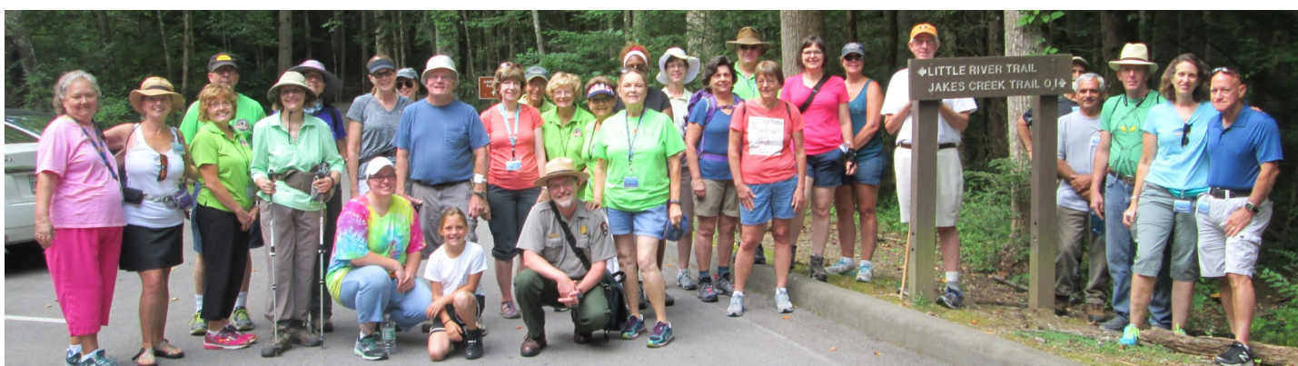
Photo submitted by Kathy Nash for 2018 Starting Point book photo contest .—Elkmont Group

If you have questions, always feel free to give me a call about your books.