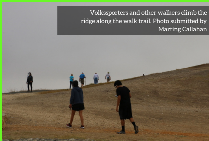
Volkssporters and other walkers climb the ridge along the walk trail.