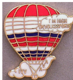
I'm High on Volkssporting Pin—$3