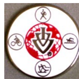
IVV World Pin—$3