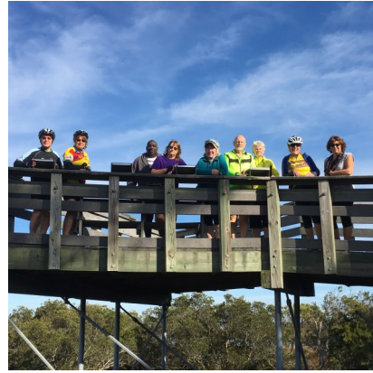
“Volksbikers on the Rehoboth Beach, DE Sea Witch Festival bike ride on October 29, 2016”.