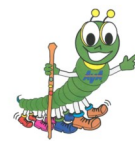
AVA Millie: the millipede