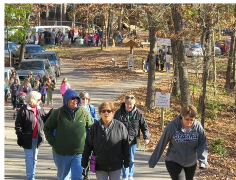
Gateway Milers World Bird Sanctuary Walk in St. Louis, MO on 11/12/16. This was also a designated Girl Scout "Walk Together" entitled Ramble with the Raptors.

December 30, 2016: Agenda and reports sent out to the NEC