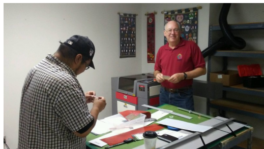
Perfection of the Stamp Process!