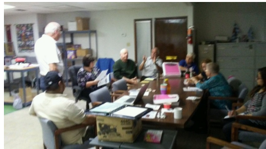
New Stamp Briefing