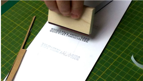
The first stamp rolls off the production line!