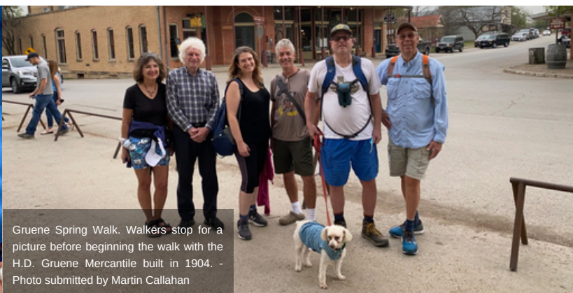
Gruene Spring Walk. Walkers stop for a picture before beginning the walk with the H.D. Gruene Mercantile built in 1904.