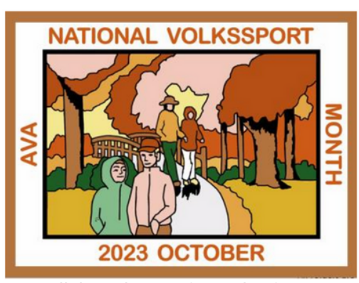
Click on image for order form.