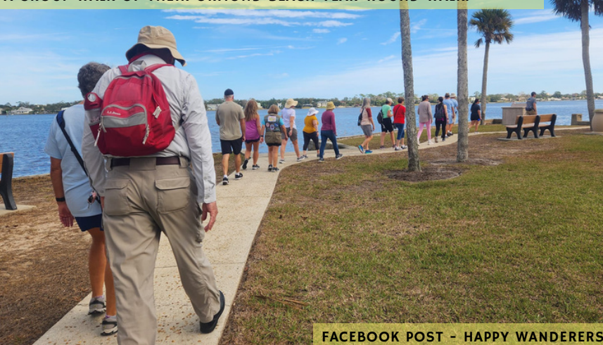
FACEBOOK POST - HAPPY WANDERERS