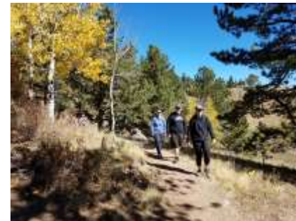
PHOTO: Walkers on a past Farish Volksmarch