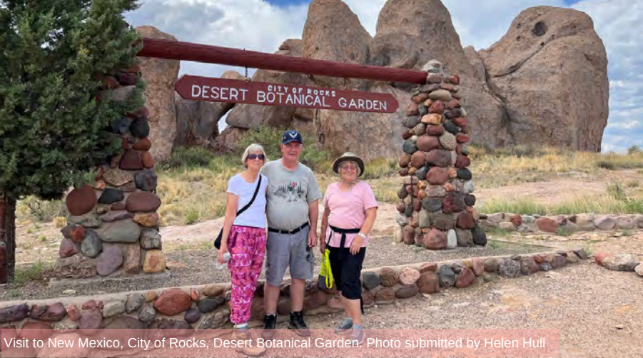
Visit to New Mexico, City of Rocks, Desert Botanical Garden.