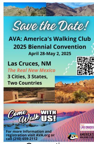
Convention Save the Date